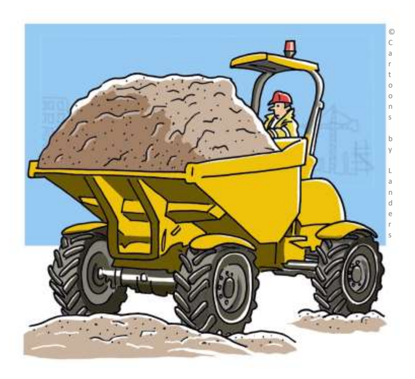
Figure 1. Example of unsafe dumper operations

An actual event occurred on a construction site and represented by the above illustration, where the loading excavator operator had placed excess material into the dumper's skip, severely masking the operator's forward vision. After reversing away from the loading area, the dumper operator proceeded to drive in a forward direction over some distance to the tipping area.